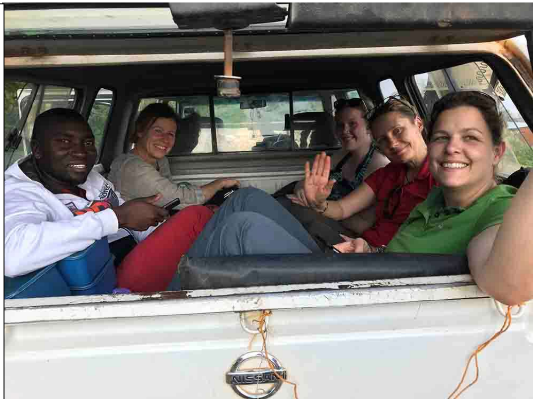
The same motley crowd as in picture above, crammed into a Nissan Hardbody 1998, a reject from the Malawi Government, for several years without odometer reading capacity, on the way to Karonga, the destination of our Sunday outing.